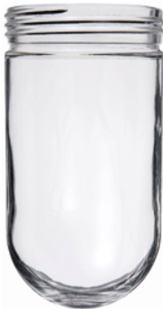
Threaded glass globes fit RAB and other standard Vaporproof fixtures and Lawn Lights Color: Clear Weight: 2.4 lbs